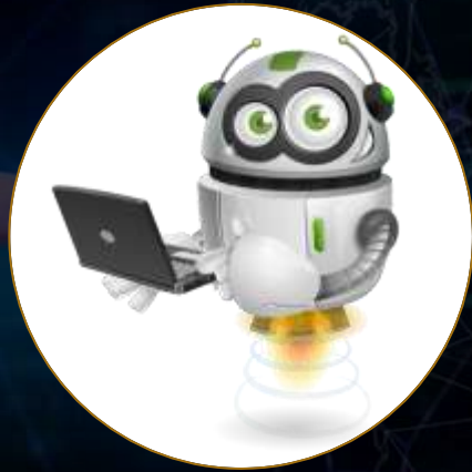
AI BOT System